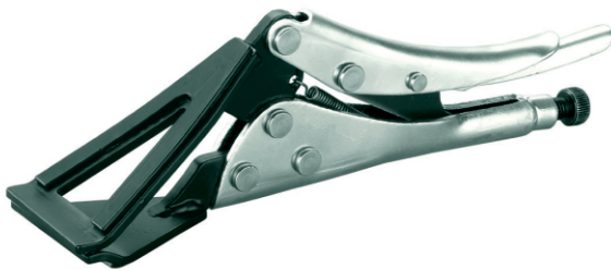
Model No. VG-3070

Holding Capacity: 2.00 kN Weight: 0.970 Kgs