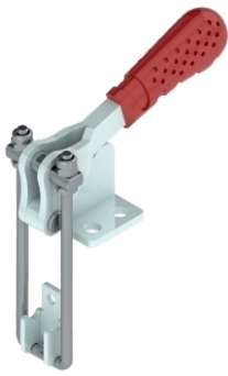
Model No. PAV-620