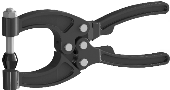
Model No. TP-3245