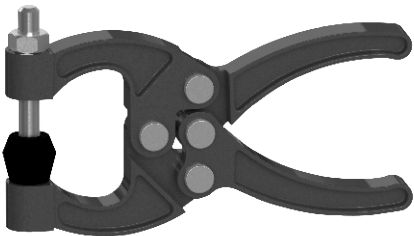
Model No. TP-2528